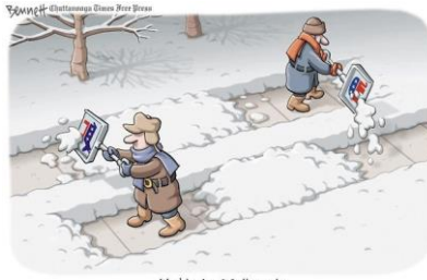
Washington D.C. digs out.

Generally we will try to have the Sunday morning service even during cold weather with small amounts of snow if the roads are clear. But please use your own judgement when attending. We do not want anyone to slip and fall because of ice on sidewalks and driveways. It is OK to stay home during bad weather.