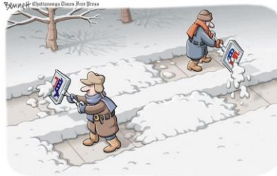
Washington D.C. digs out.

Generally we will try to have the Sunday morning service even during cold weather with small amounts of snow if the roads are clear. But please use your own judgement when attending. We do not want anyone to slip and fall because of ice on sidewalks and driveways. It is OK to stay home during bad weather.