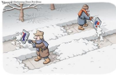
Washington D.C. digs out.

Generally we will try to have the Sunday morning service even during cold weather with small amounts of snow if the roads are clear. But please use your own judgement when attending. We do not want anyone to slip and fall because of ice on sidewalks and driveways. It is OK to stay home during bad weather.