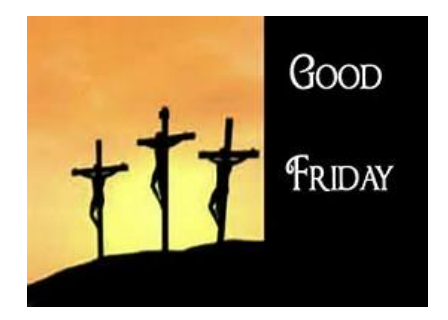
Good Friday, March 30 7:00 pm