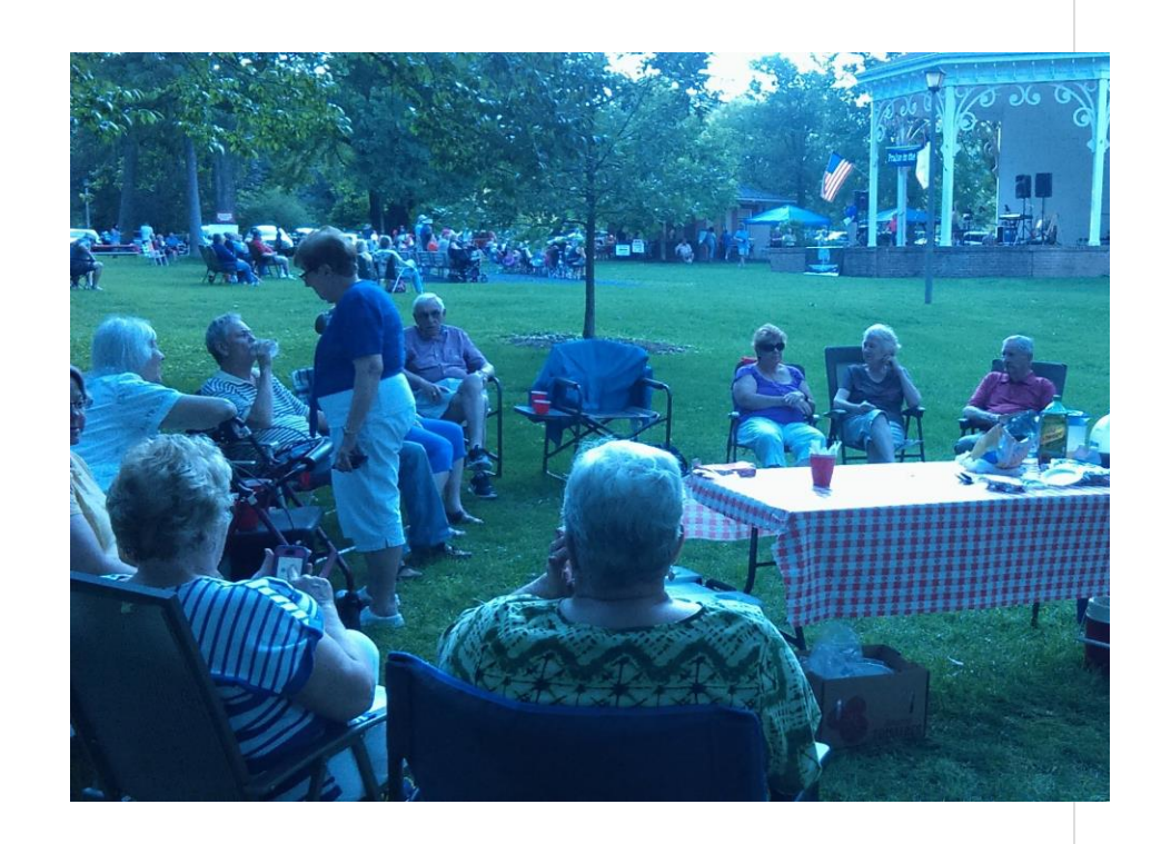
"Picnic in the Park" before "Praise in the Park"